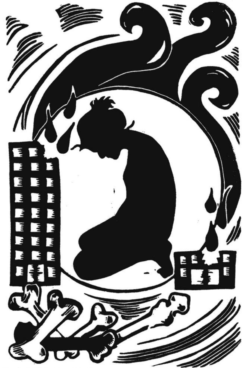
Jerusalem's Suffering (Lamentations 1)