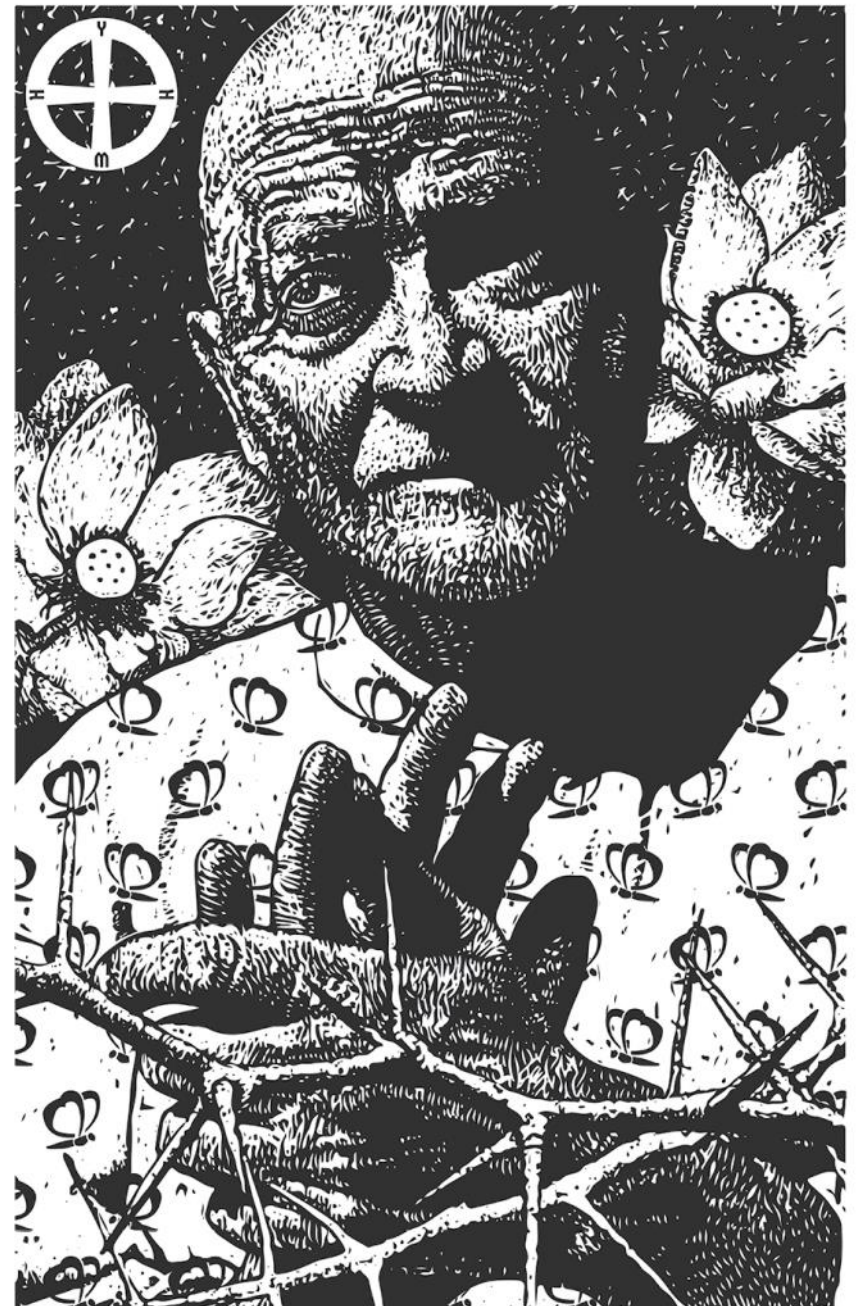
The Travails of Job (Book of Job)

9:15 AM Sunday School 10:30 AM Worship Service 4:00 PM Casa Betania Service