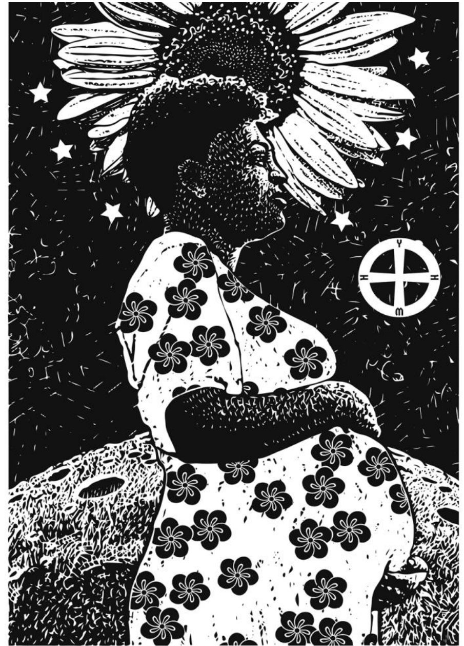
John's Vision: A Woman, Her Child, and the Dragon (Revelation 12:1-6)