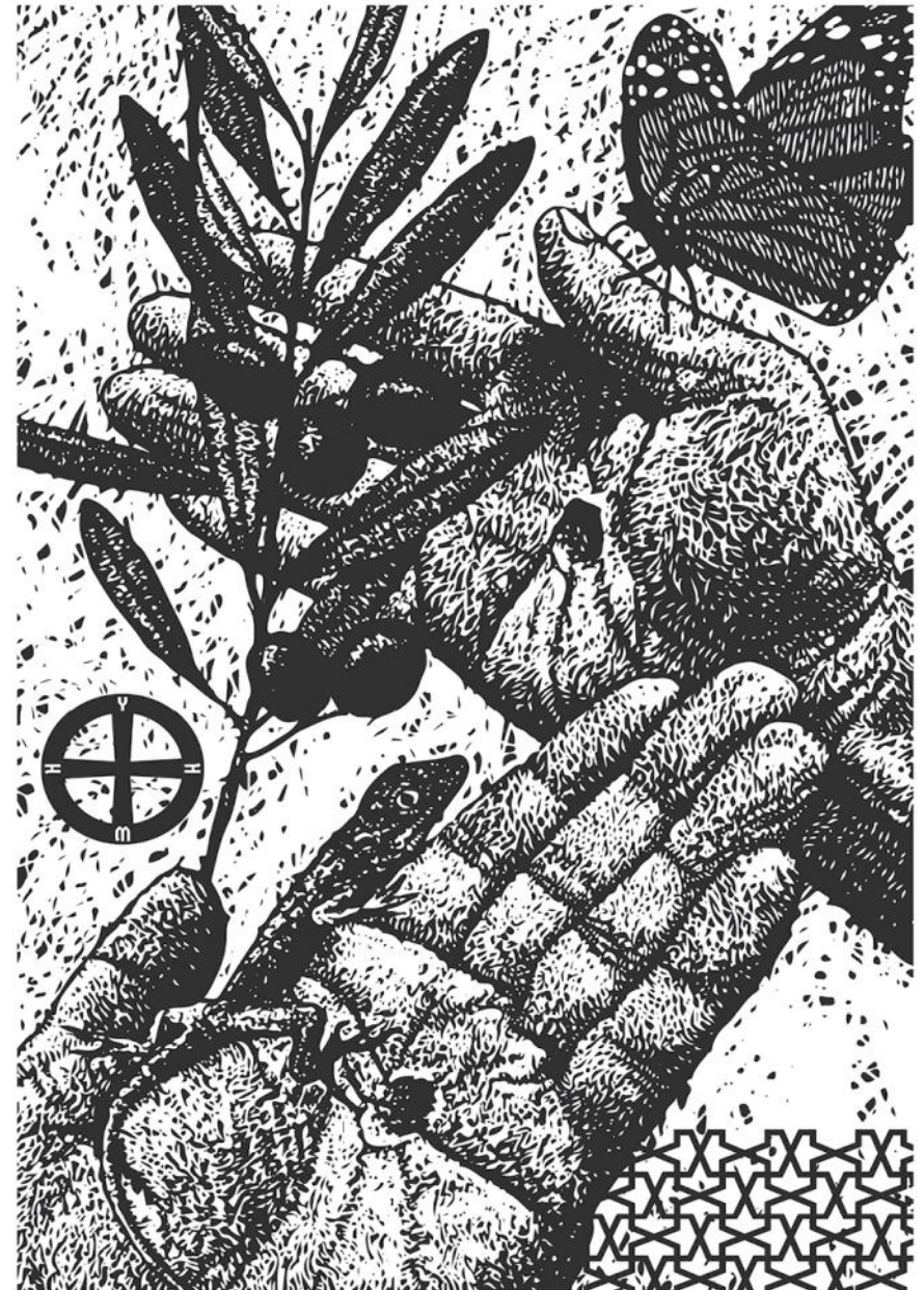
A Shoot Will Grow Up from the Stump of Jesse (Isaiah 11:1–2, 6–9)