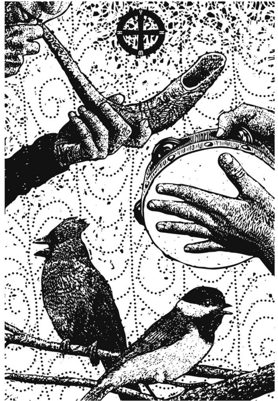
Praise the Lord! (Psalm 150)