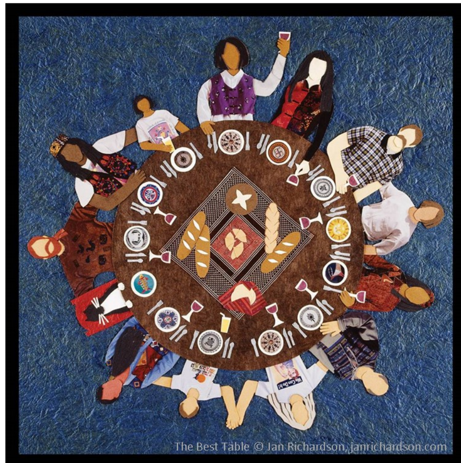
The Best Table