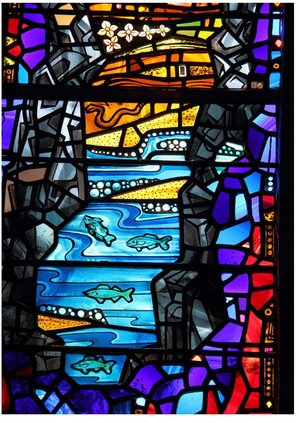
First Mennonite Church Newton, KS